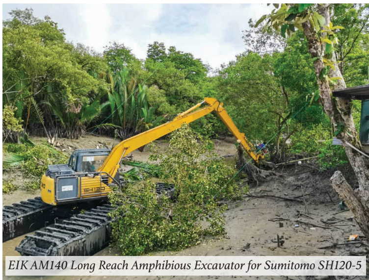
EIK AM140 Long Reach Amphibious Excavator for Sumitomo SH120-5

With its unmatched reach and stability, the AM140 has proven to be a game-changer, overcoming the challenges of soft terrain and deep silt. We're proud to support projects like this—where innovation meets sustainability, benefiting both communities and the environment.