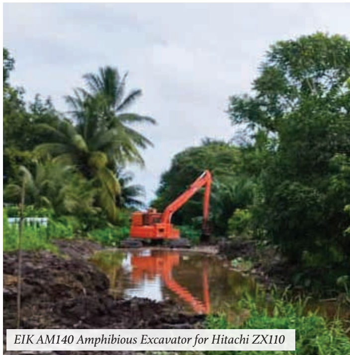
EIK AM140 Amphibious Excavator for Hitachi ZX110

Sibu's drainage and river systems are undergoing a major upgrade as part of a two-year initiative to improve water management and support future development. Spanning 10 kilometers, the project includes concrete drainage construction, river widening, and deepening to enhance water flow and reduce flood risks—critical for the region's urban expansion.