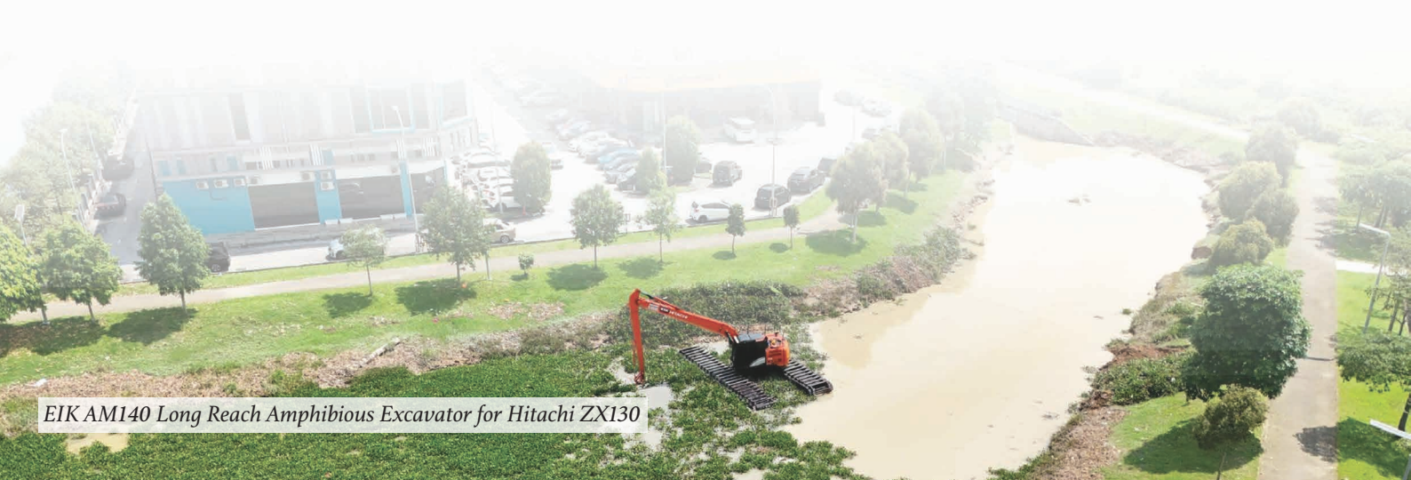
EIK AM140 Long Reach Amphibious Excavator for Hitachi ZX130