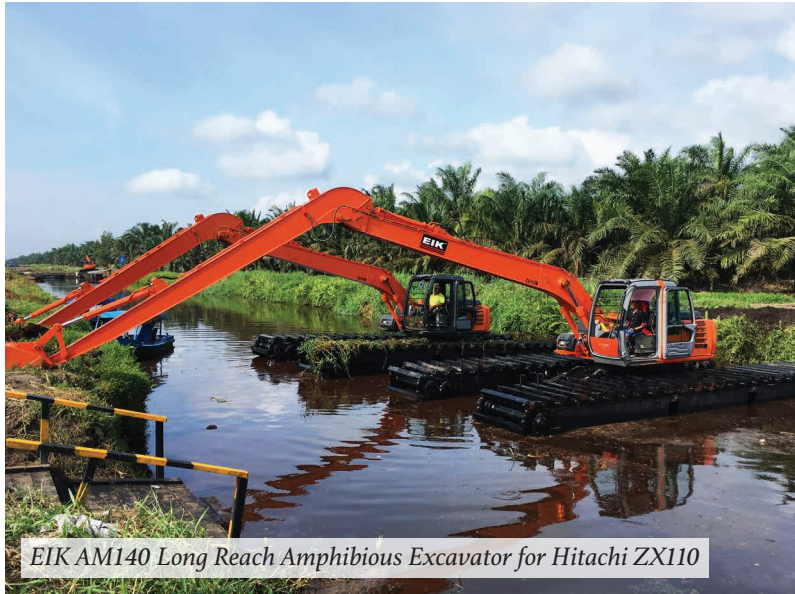
EIK AM140 Long Reach Amphibious Excavator for Hitachi ZX110

W aterway maintenance is essential for smooth transportation and efficient operations in palm oil estates. When sediment accumulates in rivers and drainage channels, it slows down harvest transport, increases maintenance costs, and causes logistical delays.