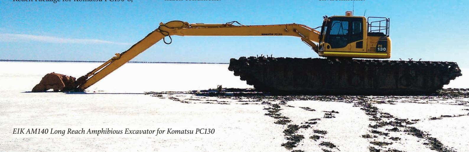
EIK AM140 Long Reach Amphibious Excavator for Komatsu PC130

This durability and efficiency, combined with an environmentally mindful approach, allowed the project team to achieve their excavation goals without compromising the lake's natural balance. EIK continues to set the gold standard in amphibious innovation—delivering performance, reliability, and sustainability in the toughest environments.