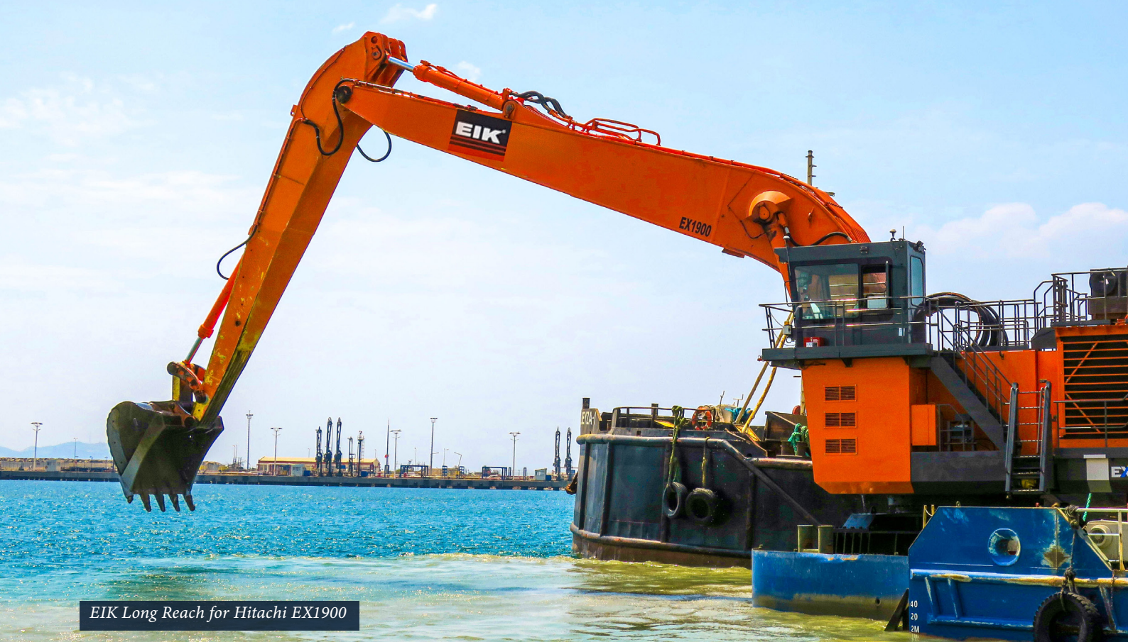
EIK Long Reach for Hitachi EX1900