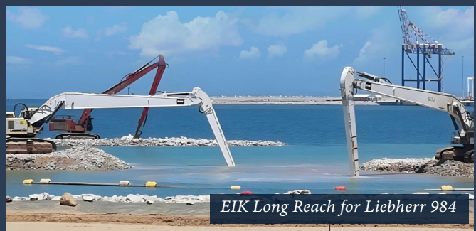
EIK Long Reach for Liebherr 984

As we reflect on this milestone from a decade past, we are reminded not only of our achievements but also of the spirit of innovation and collaboration that propels us forward. With each challenge surmounted and each milestone reached, we reaffirm our commitment to excellence and our relentless pursuit of pushing the boundaries of possibility.