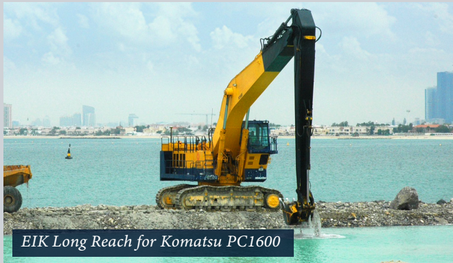
EIK Long Reach for Komatsu PC1600

Perfect for heavy-duty applications in construction, mining, quarry, and aggregate projects, the EIK PC1600 Super Long Reach, one of the flagship offerings in our extensive product lineup, is engineered to redefine excavator performance in very challenging environments.