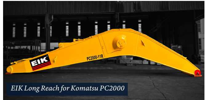
EIK Long Reach for Komatsu PC2000

Designed to be fixed on the PC2000 for marine dredging projects, the PC2000 Standard Boom stands out as one of the consistently requested models within the big boom range, with numerous repeat orders received over the years. The most recent iteration was completed last year to address the unique requirements of port projects in East Asia.