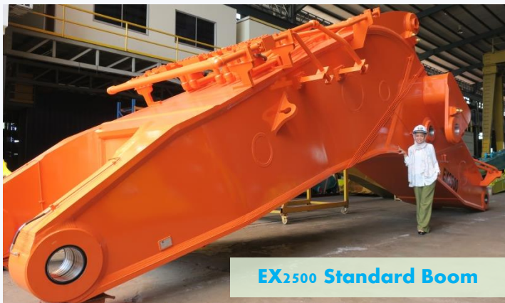
EX2500 Standard Boom

WE BUILD WITH PRIDE, YOU USE WITH TRUST.