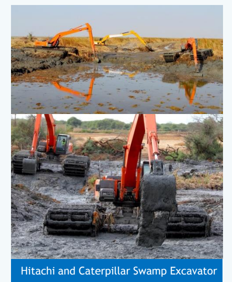
Fear no terrain, trump in swamp

In most occasions, it is indeed not easy for potential customers to visualize or imagine how amphibious excavators can help them to accomplish a job that seemingly impossible to execute, and therefore creating challenges in justifying the investment.